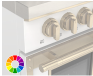
F4EIR486BR1-RAL RAL CODE