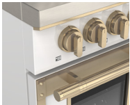
F4EIR486BR1-WH GLOSSY WHITE RAL 9016