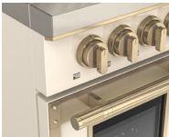
F4EIR486BR1-IV GLOSSY IVORY RAL 1015