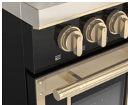
F4EIR486BR1-BK GLOSSY BLACK RAL 9004