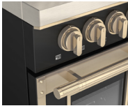
F4EIR486BR1-MB MATTE BLACK RAL 9004