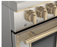
F4EIR486BR1-SS STAINLESS STEEL