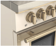
F4EIR486BR1-MI MATTE IVORY RAL 1015