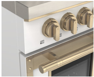
F4EIR486BR1-MW MATTE WHITE RAL 9016